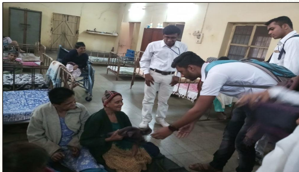
DISTRIBUTION OF BLANKET AT CHESHIRE'S HOME by NSS