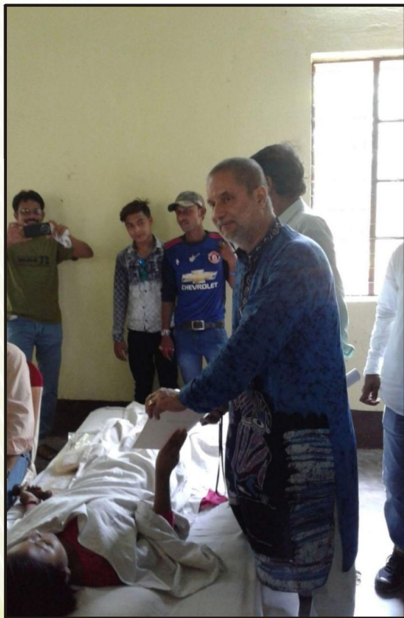
CERTIFICATE AWARDED TO THE BLOOD DONOR by HONOURABLE PRESIDENT