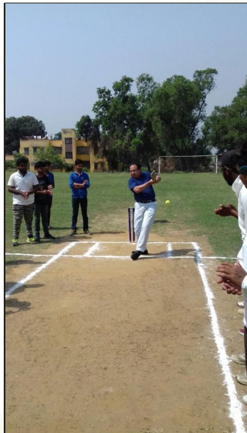
INTER COLLEGE CRICKET TOURNAMENT INAUGURATED by V.C, KNU