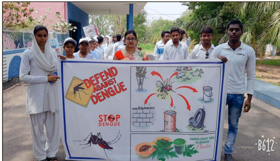
DENGU AWARENESS GOVT. PROGRAM by COLLEGE