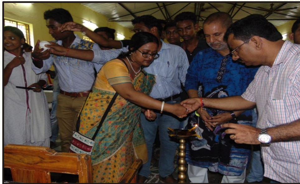
INAUGURATION OF BLOOD DONATION CAMP