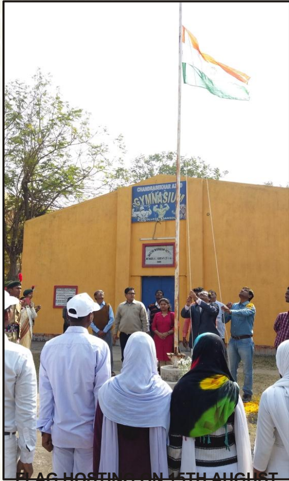
FLAG HOSTING ON 15TH AUGUST