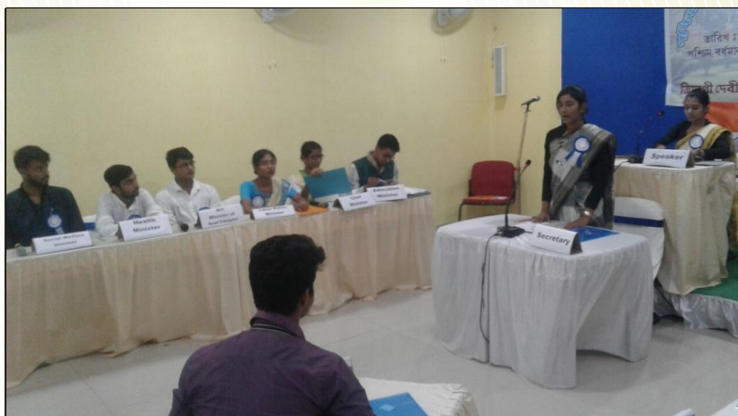
OUR STUDENT in YOUTH PARLIAMENT