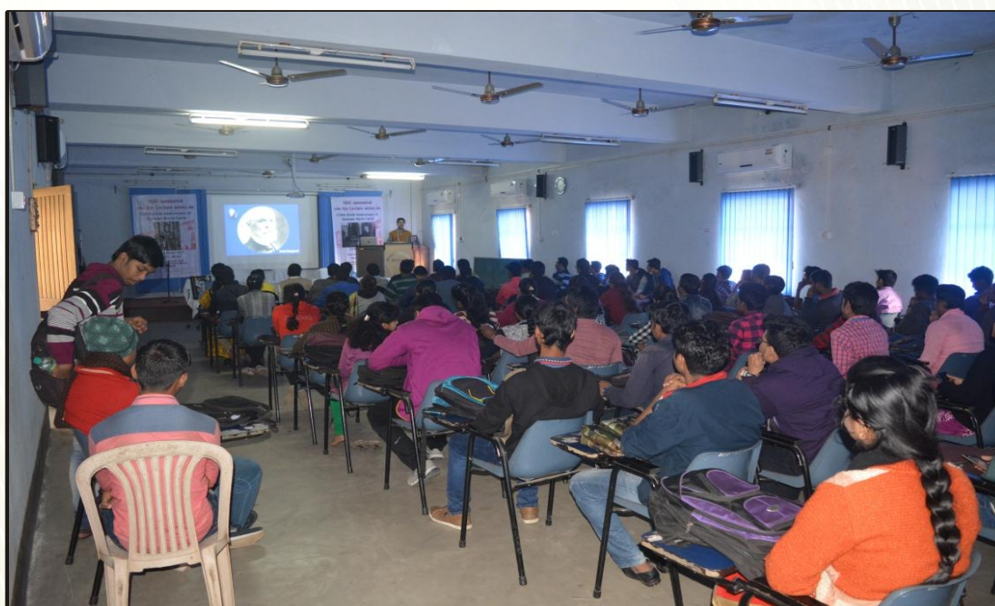
IQAC SPONSORED NATIONAL SEMINAR on MADAME CURIE